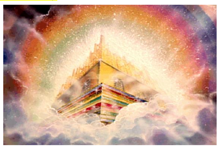
"...ye are come unto mount Sion, and unto the city of the living God, the heavenly Jerusalem...To the general assembly and church of the firstborn, which are written in heaven, and to God the Judge of all, and to the spirits of just men made perfect" Hebrews 12:22-23

In conclusion, given the destruction of the dragon's seven crowned heads together with the kings and the ungodly cities associated with those heads, today's believer with the exhortation to "stand fast in the faith" 1 Corinthians 16:13 and the promise of "the holy city, new Jerusalem" Revelation 21:2 to come, can look forward to a city<sup>7</sup> after the manner as Paul states in Hebrews 11:16 "But now they desire a better country, that is, an heavenly: wherefore God is not ashamed to be called their God: for he hath prepared for them a city":