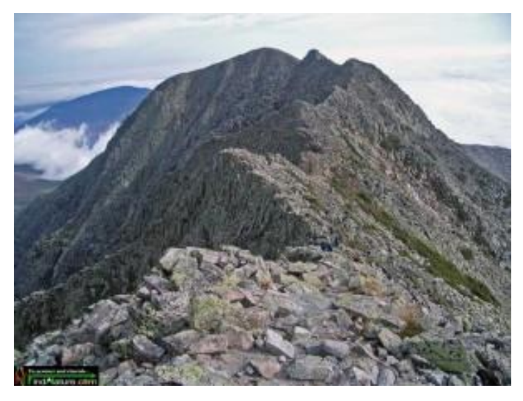
The Greatest Mountain