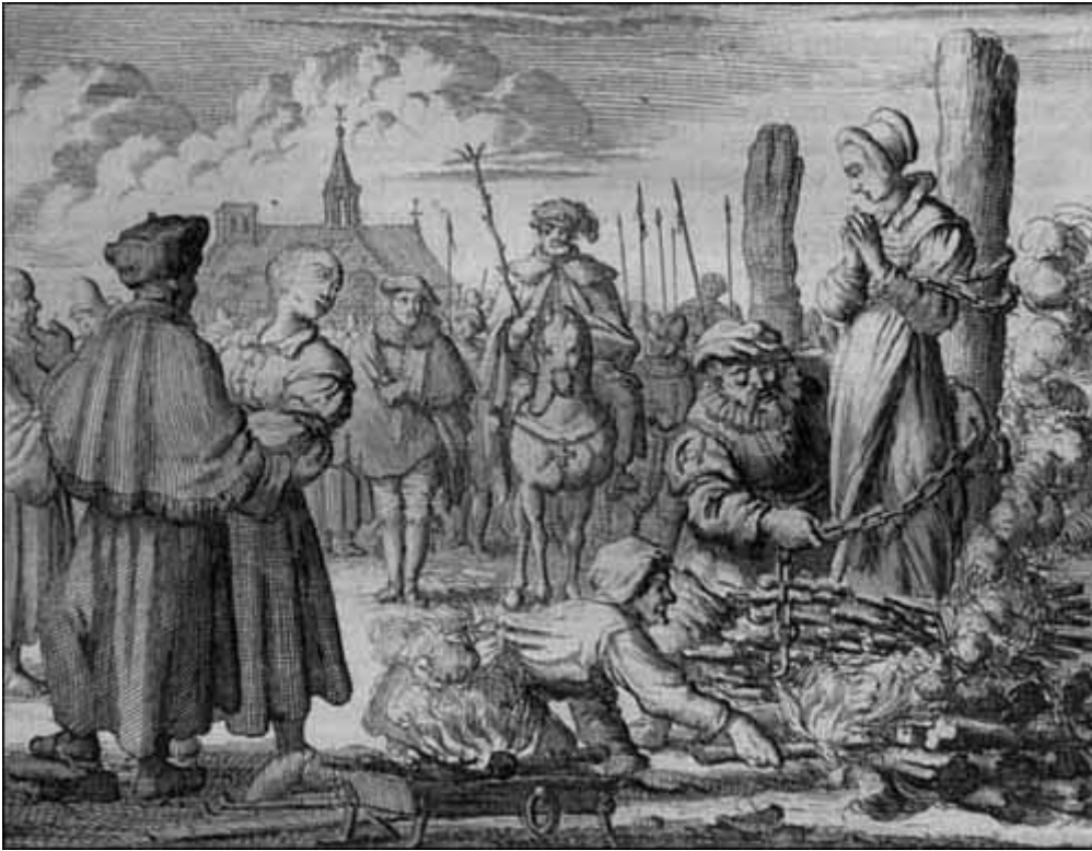
Joan Bocher of Kent, Martyred May 2 1550

See also this wonderful sister's testimony. This writer can't wait to meet her – and the second sister: