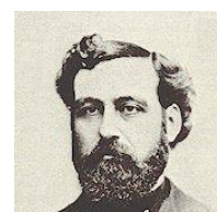
Philip P. Bliss 1870