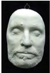
Oliver Cromwell's Death Mask!

Take for example Oliver Cromwell. Cromwell was a devout Christian who read and lived the Scriptures daily. He is in Heaven right now as you are reading this booklet because he asked the Lord Jesus Christ to forgive him of all his sins! We are