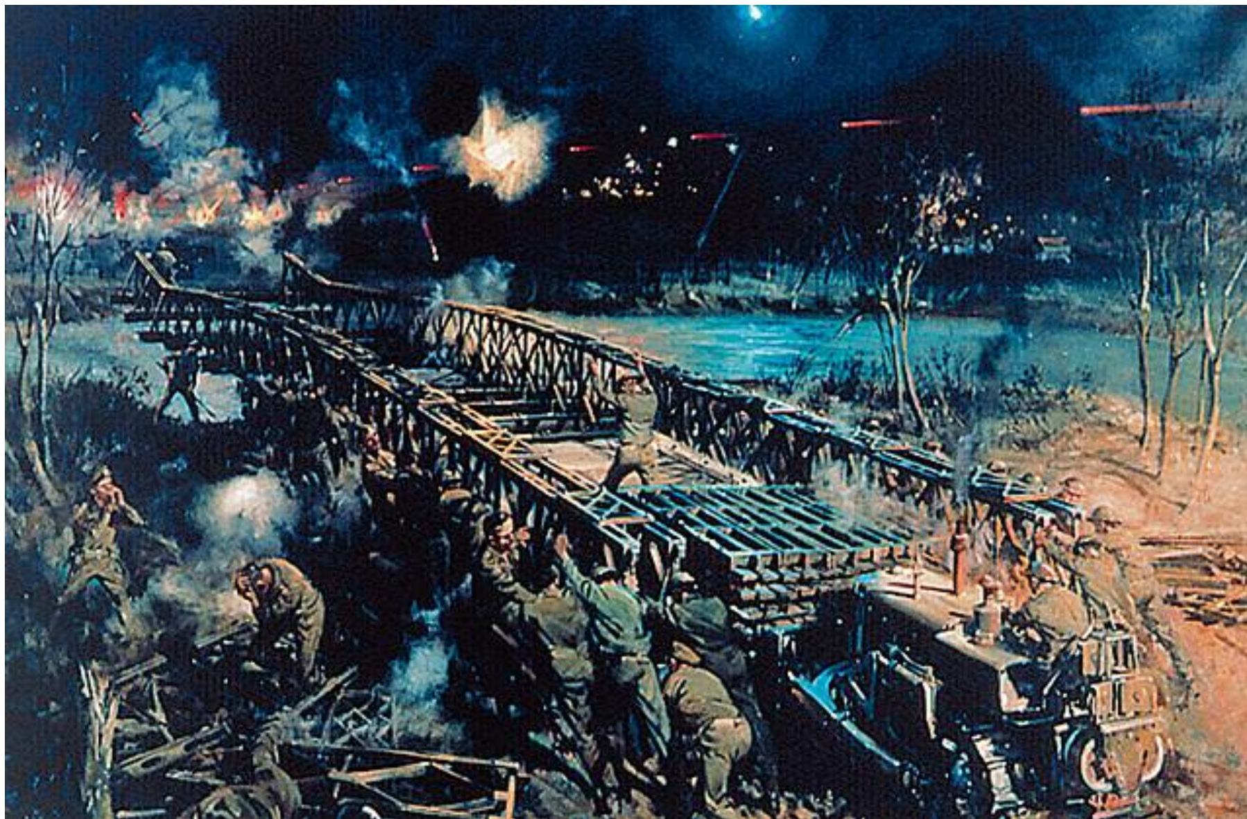
Rapido Crossing May 12 th -13 th 1944 9