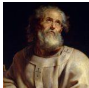
Peter the apostle artist's impression

But while Peter was central in the early spread of the gospel (part of the meaning behind Matthew 16:18-19 ), the teaching of Scripture, taken in context, nowhere declares that he was in authority over the other apostles, or over the church (having primacy). See Acts 15:1-23 ; Galatians 2:1-14 ; and 1 Peter 5:1-5 . Nor is it ever taught in Scripture that the bishop of Rome, or any other bishop, was to have primacy over the church. Scripture does not even explicitly record Peter ever being in Rome. Rather there is only one reference in Scripture of Peter writing from "Babylon," a name sometimes applied to Rome ( 1 Peter 5:13 ). Primarily upon this and the historical rise of the influence of the Bishop of Rome come the Roman Catholic Church's teaching of the primacy of the bishop of Rome. However, Scripture shows that Peter's authority was shared by the other apostles ( Ephesians 2:19-20 ), and the "loosing and binding" authority attributed to him was likewise shared by the local churches, not just their church leaders (see Matthew 18:15-19 ; 1 Corinthians 5:1-13 ; 2 Corinthians 13:10 ; Titus 2:15 ; 3:10-11 ).