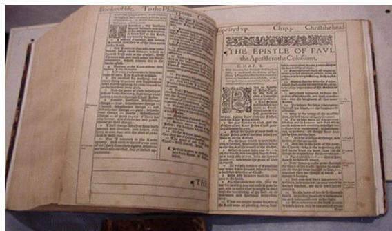
The Authorized 1611 King James Holy Bible

Philippians 2:16 states “ Holding forth the word of life; that I may rejoice in the day of Christ, that I have not run in vain, neither laboured in vain. ” Inspiration must be inviolate throughout the purification process of “ the word of life ” otherwise it is no longer “ the word of life ” and Paul and the other writers of scriptures would have run and laboured in vain. However, they did not, because “ the word of the Lord endureth for ever ” 1 Peter 1:25. An overview of the seven-stage purification sub-processes embedded in the overall purification process.