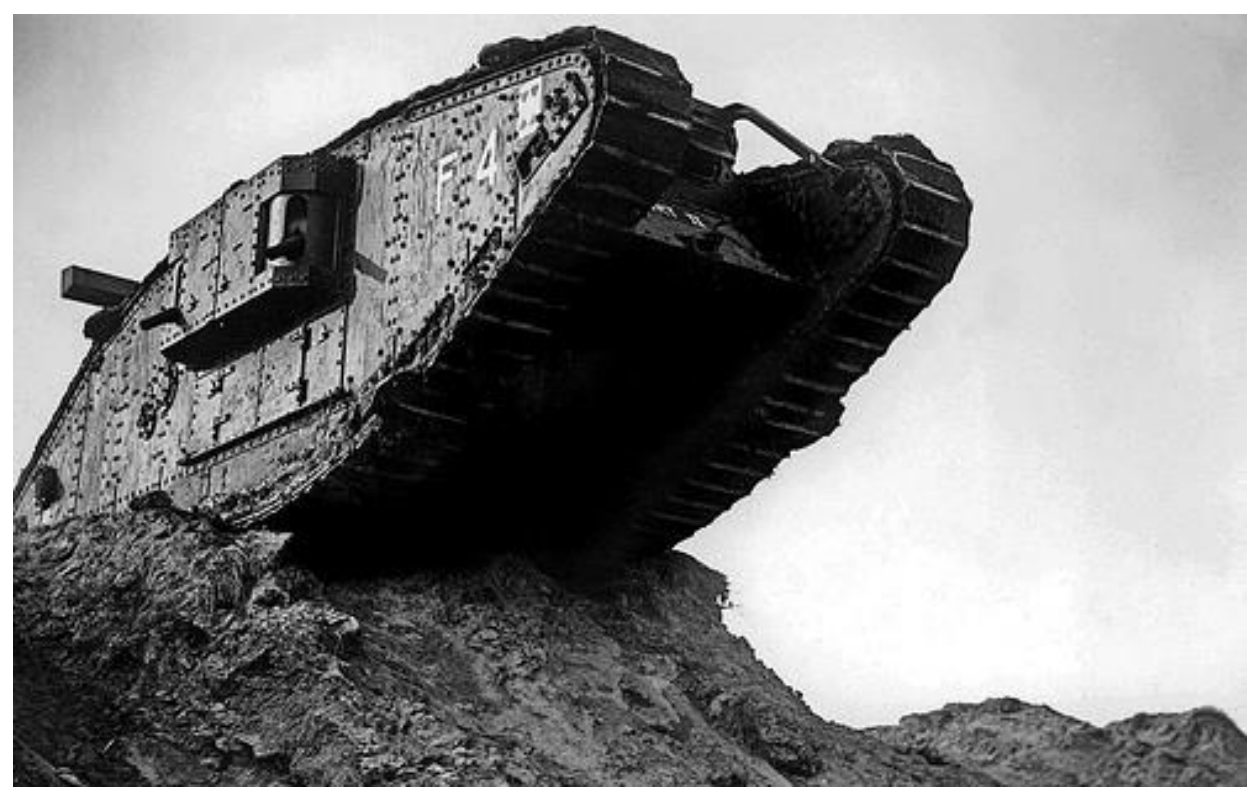
"Someone in the trench said, "THE DEVIL'S COMING!""

"...your <u>adversary the devil</u>, as a roaring lion, walketh about, seeking whom he may devour:" 1 Peter 5:8