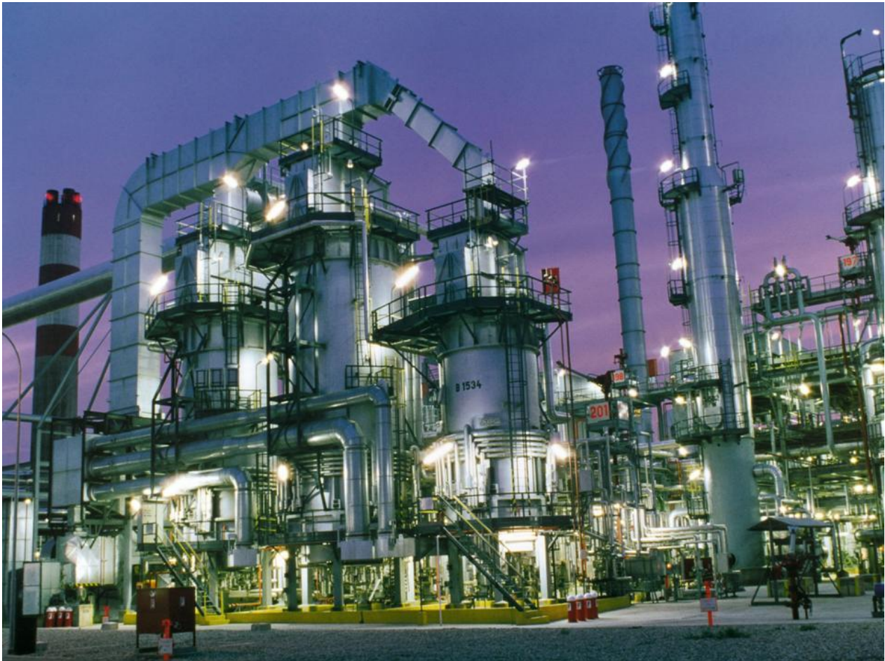
Oil Refinery Plant