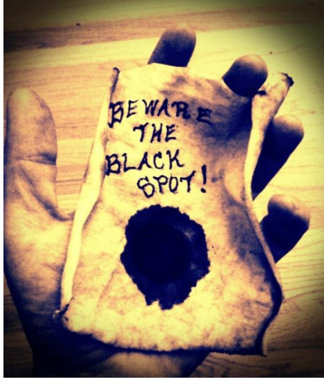
"Why, hillo! Look here, now; this ain't lucky! You've gone and cut this out of a Bible. What fool's cut a Bible?" Long John Silver, Treasure Island by R. L. Stevenson<sup>19</sup>, The Black Spot Again "...What fool's cut a Bible?"

Table The 1611 Holy Bible vs. Vatican Versions, New Testament Verses Cut or Criticised 1984, 2011 NIVs, 1977, 1995 NASVs, Ne Nestles 21<sup>st</sup> Edition, NLT New Living Translation, 1984, 2013 NWTs, JB, NJB Jerusalem, New Jerusalem Bibles. The NKJV<sup>20</sup> footnotes f.n's dispute i.e. criticise all the following scriptures