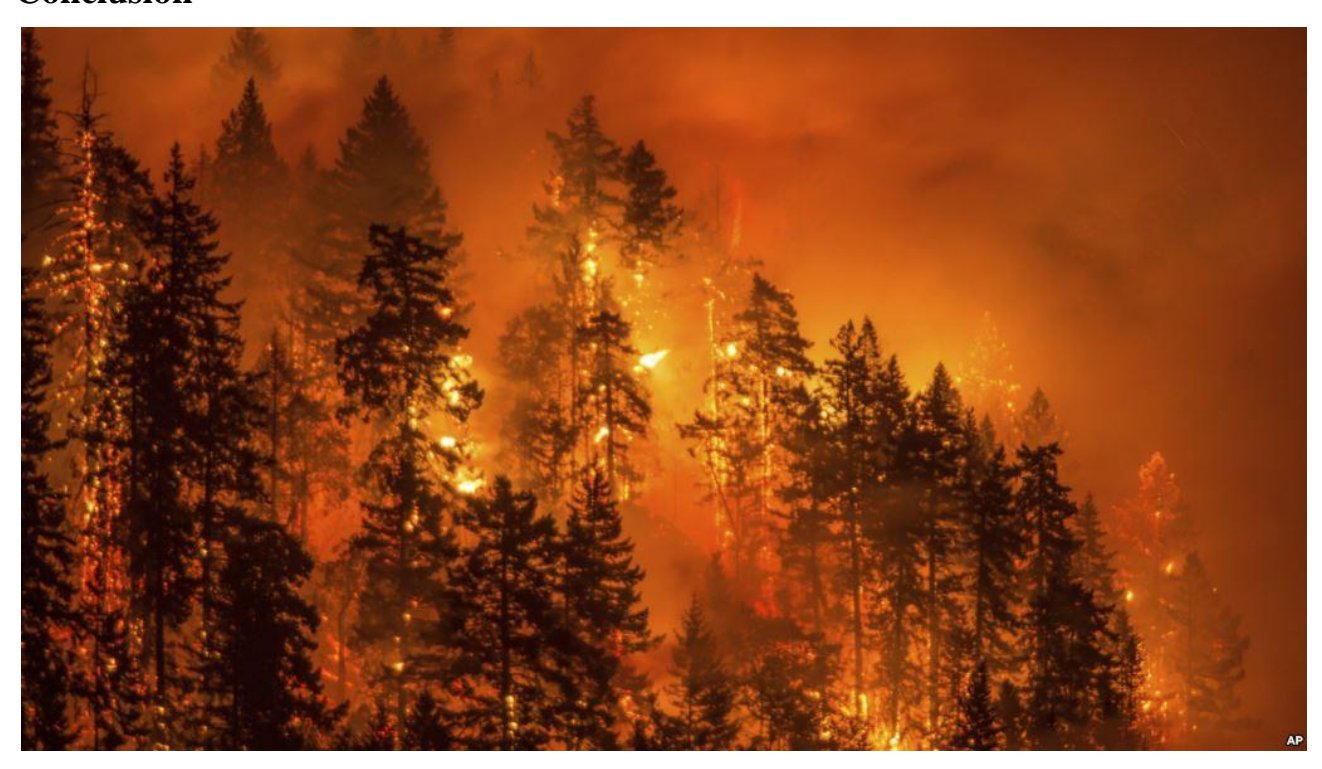
But I will punish you according to the fruit of your doings, saith the LORD: and I will kindle a fire in the forest thereof, and it shall devour all things round about it Jeremiah 21:14

Thus saith the LORD; Stand in the court of the LORD'S house, and speak unto all the cities of Judah, which come to worship in the LORD'S house, all the words that I command thee to speak unto them; diminish not a word Jeremiah 26:2